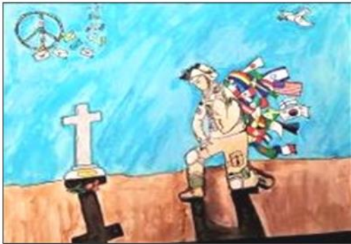
MD44 FIRST PLACE - MADISEN ENO CONCORD LIONS