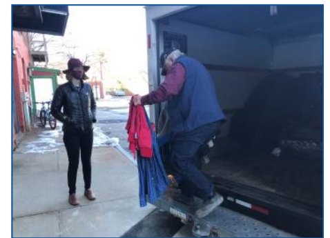
Amazing efforts of the Atkinson Lions club delivering coats, winter wear and blankets to Waypoint !! These will go to youth and young adults experiencing homelessness!