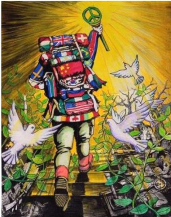
Zhuo Zhang, 12 years old - China