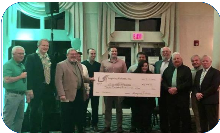
Senator Chuck Morse's foundation Inspiring Futures March 14th at the Atkinson Country Club, $2500.donation to Camp Pride.