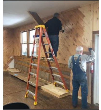
Lions busy at Camp Pride making a few improvements before the summer camping season