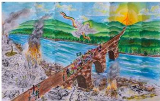
Keira Brodsky, 13 years old - Virginia, USA