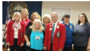
Salem Lions Visitation