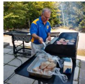
Lions Camp Pride BBQ