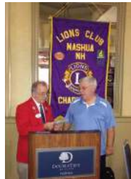
Nashua Lions Club