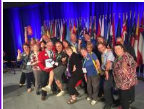
USA Canada Forum