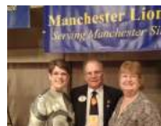
Manchester/Nashua 95th Anniversary