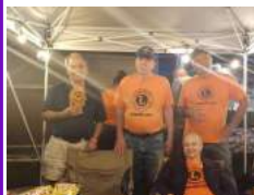
Sandown Old Home days