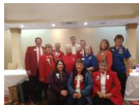
District 44h Cabinet Meeting