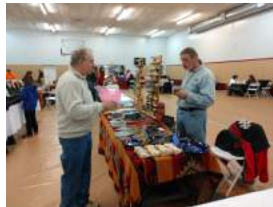
Hudson Psychic Fair