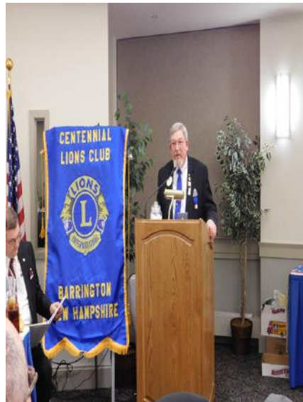
Welcome Barrington Lions