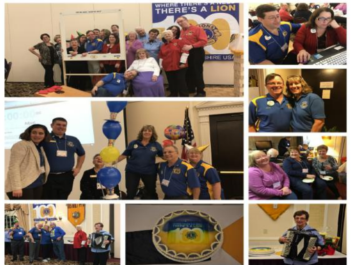
Longest in Lions and newest in Lions.