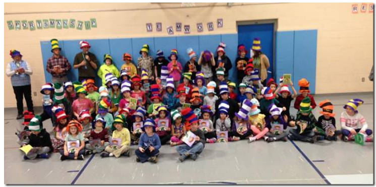
Photo Caption 2: Sandwich Central School students (with their Dr. Seuss hats on) display the books given to them by the Moultonborough Lions Club.